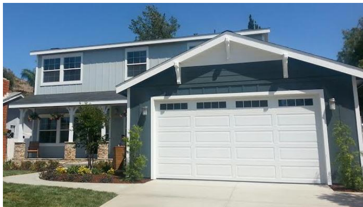
Pictured Above: Two-story home Cavco built for “The Ellen Degeneres Show” to give to a deserving family