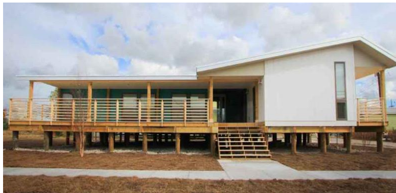
Pictured Above: Recipient of “Builder’s Choice & Custom Home Design Award”