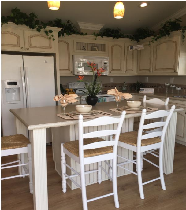
Pictured Left and Below: Cavco-built small HUD-code home displayed in Tampa RV Show