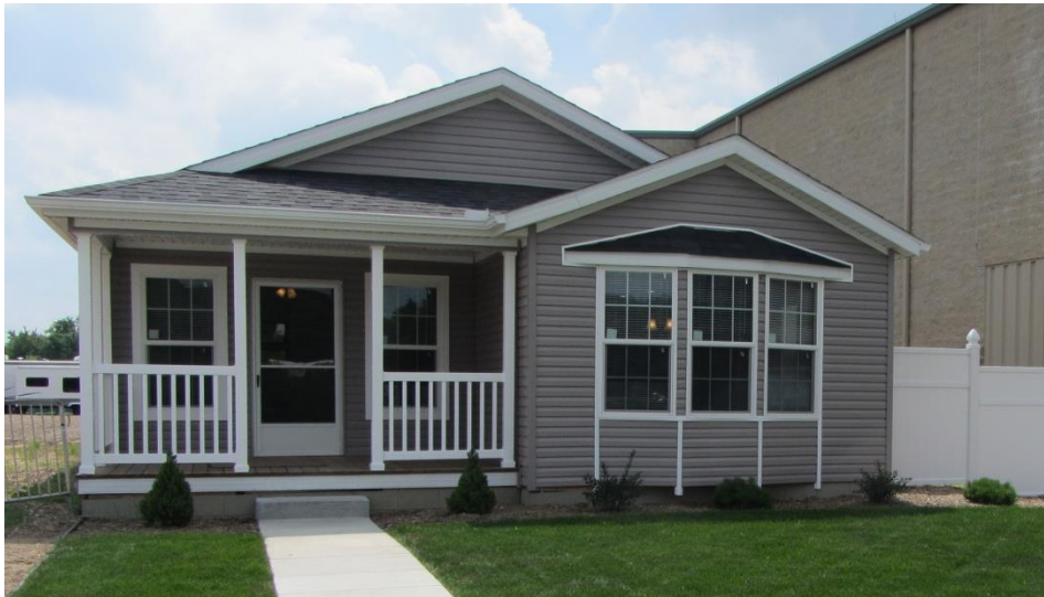
Pictured Left: Home donated to MH Hall of Fame to showcase modern design and value