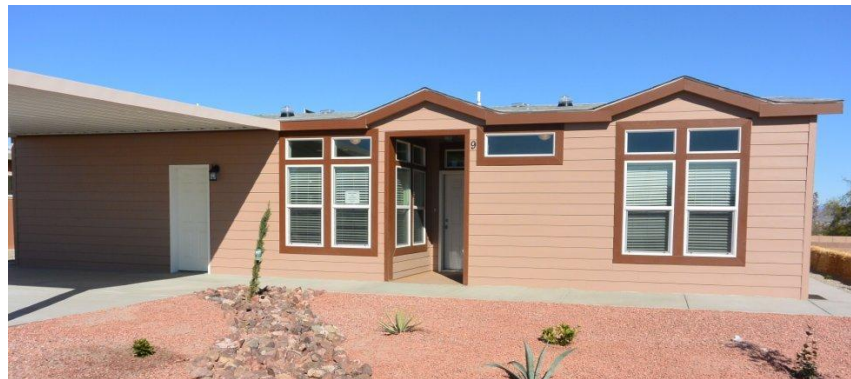
Pictured Above: Two customized designs for newly developed Yuma, AZ community