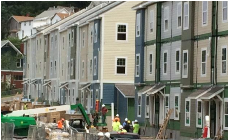
Pictured Above: Cavco’s innovative student housing at West Virginia University