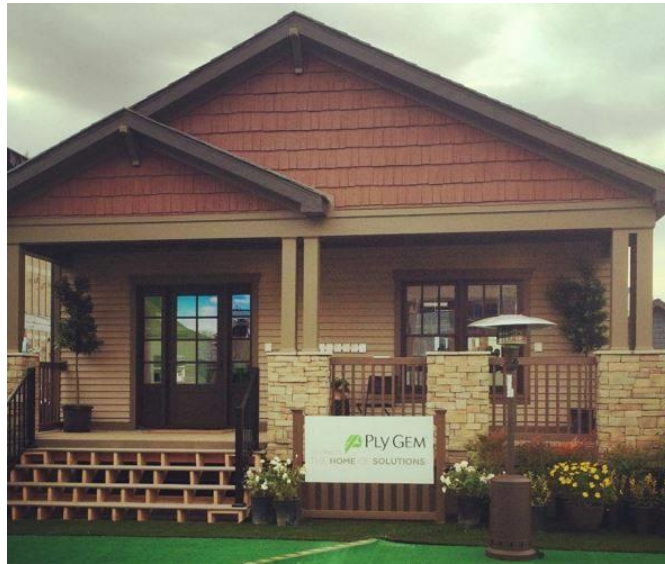
Pictured Above: Cavco showcasing factory building design capabilities