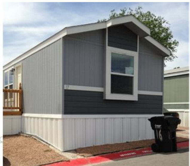
Pictured Above: Modern energy efficient replacement home in a long established community