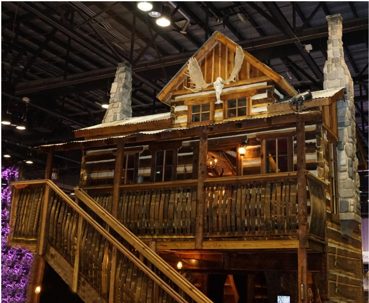
Pictured Above: Home reminiscent of a tree house receives the “Image Award”