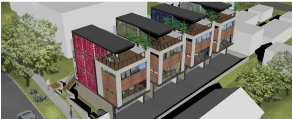
Pictured Above: Fully custom modern home with high-end amenities Pictured Left: Rendering of finished development in Los Angeles