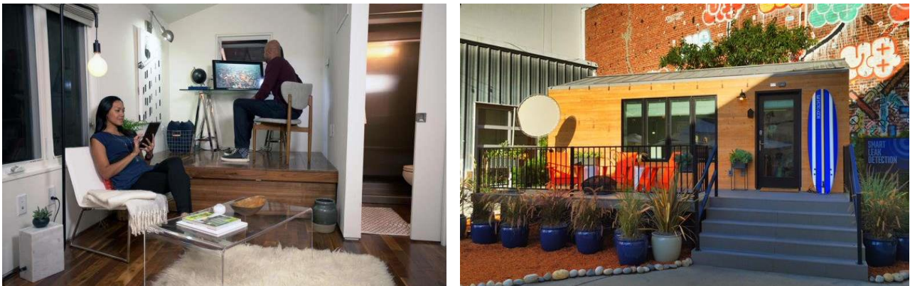
Pictured Above: Smart device controlled micro-space home built by Cavco